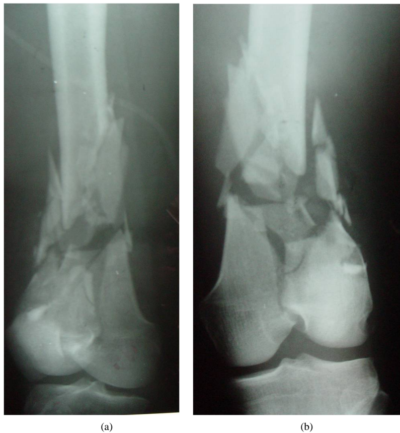
Figure 1. A 36 years old man with open (type IIIA of Gustilo classification) severe comminuted fractures of right distal femur (type C2 of OTA classification) due to motor cycle accident.