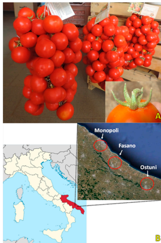
Figure 1. Bunches, so-called ramasole, of Regina tomato with a focus on the fruits calyx (A); map of Italy with Puglia region (highlighted in red) and a focus of the three sites (within the circle) where the Regina tomato ecotypes were cultivated and collected (B).

Regina is the name of a tomato landrace grown in the coastal saline soils of the central Puglia. This landrace takes its Italian name, Regina (Italian for "Queen"), from its calyx (Figure 1A), which takes the shape of a crown as it grows. It is listed as an item in the 'List of Traditional Agri-Food Products' of the Italian Department for Agriculture, since its processing, preservation and ageing methods are consolidated in time, harmonious for all the region involved, according to traditional rules, for a period not less than 25 years. Moreover, this landrace is registered also as 'Slow Food presidium' by the Slow Food Foundation [7] that aims to protect authenticity and origin of Italian traditional food products by valorising a geographical area and stimulating market opportunities.